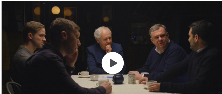
Ian Darke leads the ESPN panel in predicting the 2018 World Cup winner with names of Germany, Brazil, France and England among the list. (4:18)